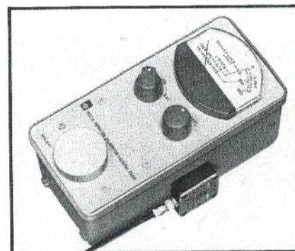
View of the calibrator with Type 1560-P52 Vibration Pick-up attached.